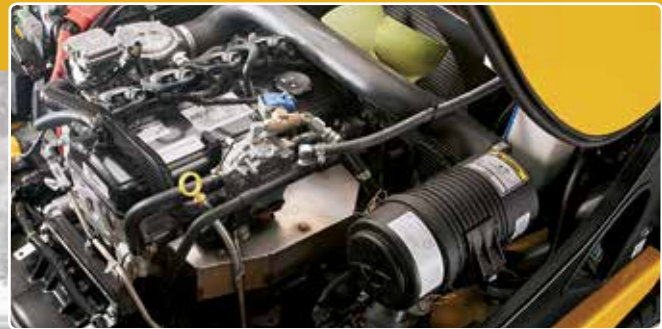
PSI 2.4L engine

The MX series includes adjustable modes to deliver an extra boost of performance to power through peaks or maximize fuel economy to control costs – whatever your application requires in real time. With Yale Flex Performance Technology, the PSI 2.4L engine generates 62 horsepower in the highest mode, providing exceptional acceleration and travel speed.