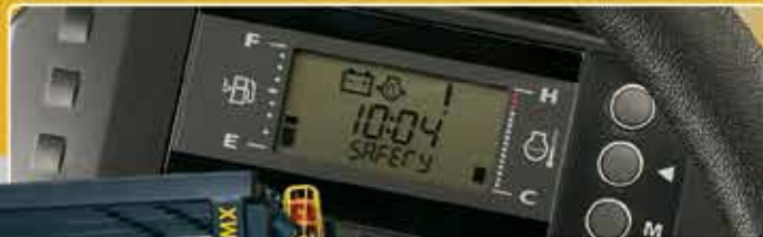
Integrated dash display